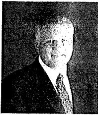
P O Box 487 Shelbiana KY 41562